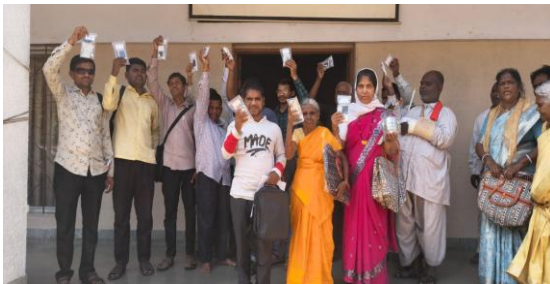
Distribution of Audio Bibles and bags