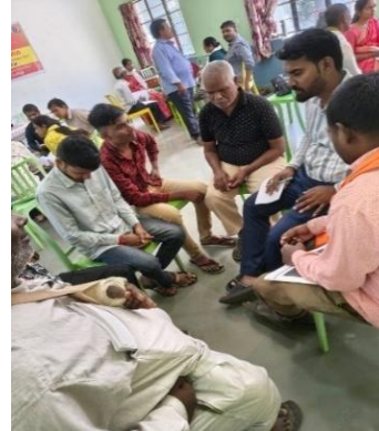
Time of Intercession