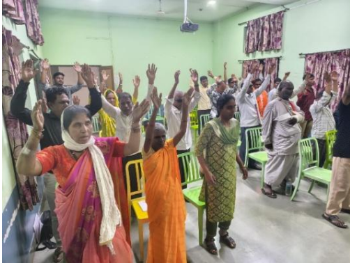
Praise and worship

The camp concluded with the distribution of audio Bibles and bags to all the visually challenged believers. Almighty God be praised for His protection and care throughout this retreat.