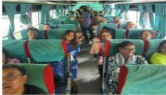
Praise & Worship